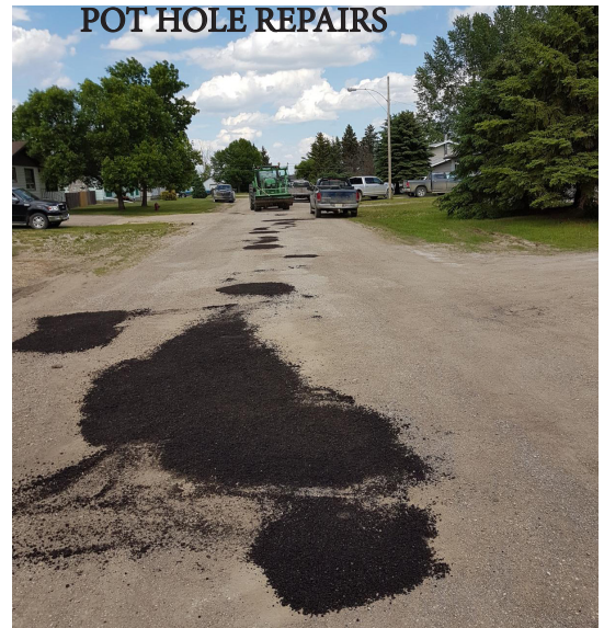
POT HOLE REPAIRS

The Theodore Historical Museum is planning to open this Summer! We are hoping to open the museum for 2 days a week this year and will look at expanding on those hours next year! Stay tuned to the website / facebook pages / paper for opening day and hours!