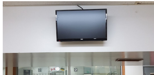
TV IN ARENA LOBBY TO PROMOTE EVENTS & ADVERTISING