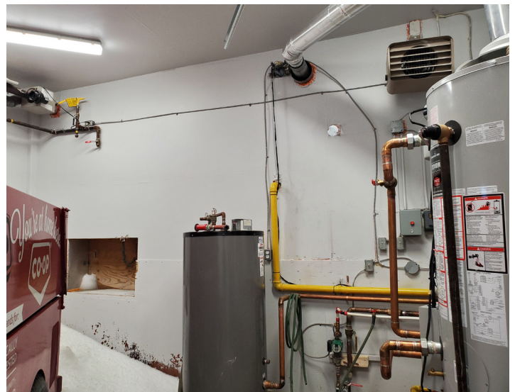
REFURBISHED ZAMBONI ROOM @ REMAX ARENA