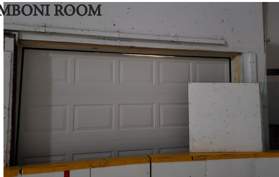
NEW DOOR FOR ZAMBONI ROOM