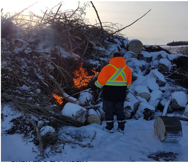
BURN PILE @ LANDFILL