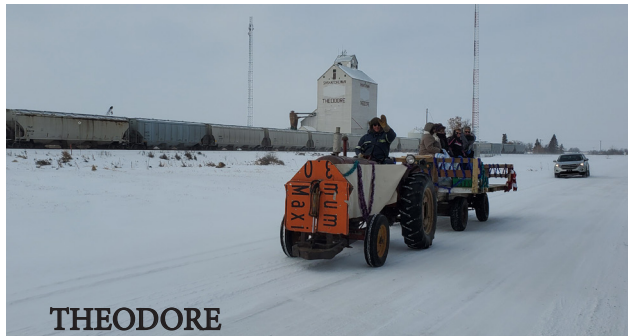
THEODORE FAMILY CHRISTMAS WAGON RIDES