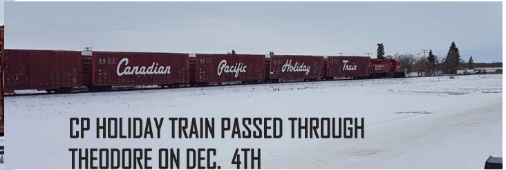
CP HOLIDAY TRAIN PASSED THROUGH THEODORE ON DEC. 4TH