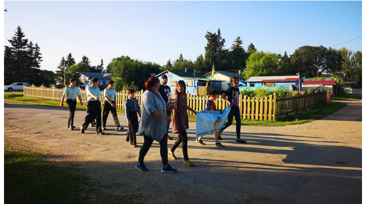
PARADE TIME JULY 12 IN THEODORE

The Village participated in the Parade on July 12th! We entered our fire truck and emergency van and there was some great participation from a lot of others! A great turnout along the route made the evening a lot of fun for everyone!