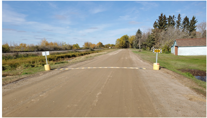
<<<SPEED BUMPS ON ANDERSON & RAILWAY AVE.

* Council held its regular meeting on Sept. 18th and we reviewed a number of different topics/ issues and you can catch up on our council minutes anytime through the village website.